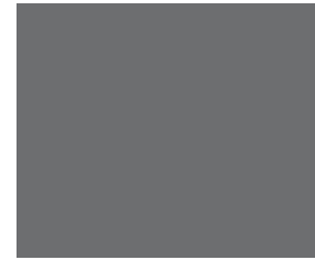
Signia Dark Gray

CMYK 2|100|85|6 RGB 215|9|38 PNT 186 C RAL 3020 HEX #d60925